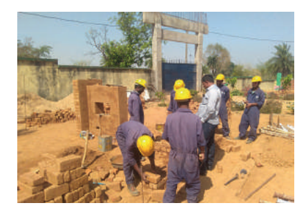
Masonary workshop in progress at PARFI Gurukul